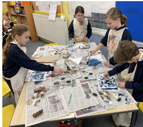
Self Portraits by Clover Class

We learnt to draw a face using the correct proportions, and then tried to draw a self portrait using pencil We made our own painting tool, using feathers, string, cork, cardboard and sponge. Then created a self portrait using paint We looked at the cubism work of Pablo Picasso and created our portrait in the same style We created our faces out of clay, when the clay had dried we were able to paint them