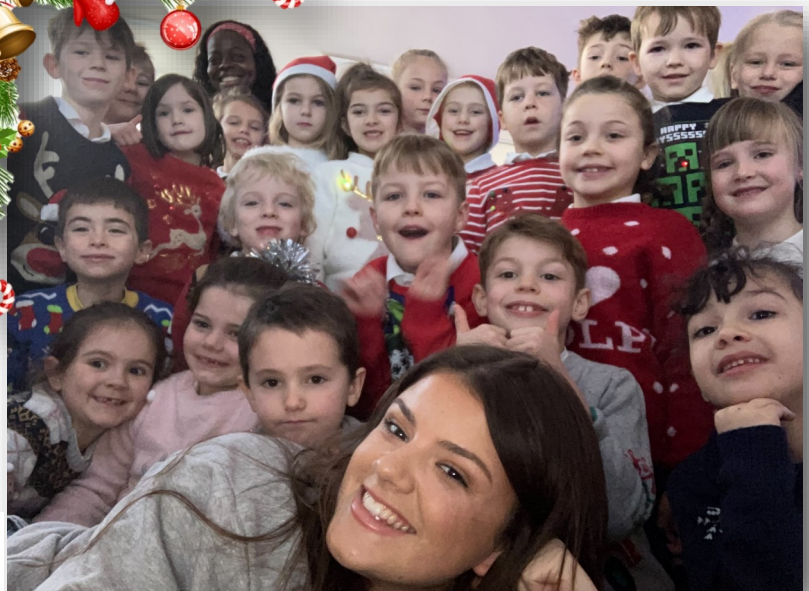
Honeysuckle class looking fabulous in their Christmas jumpers