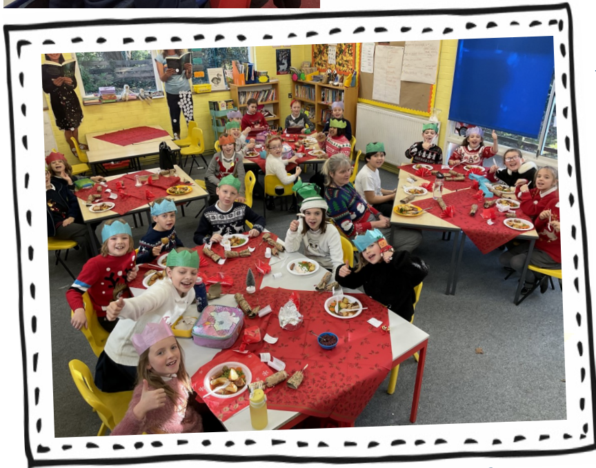
Clover class enjoying their Christmas dinner today